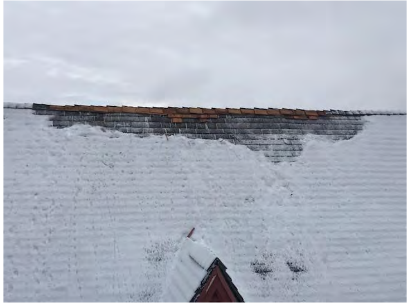
Ridge Cap - After