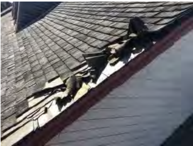
Wood Shake - Before