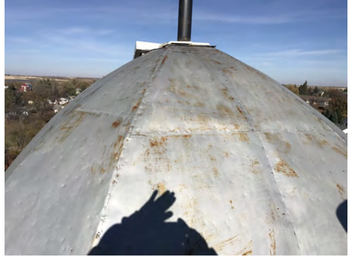
South Tower Metal Dome - Before