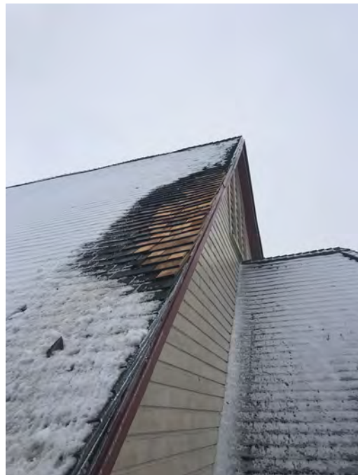
Wood Shake - After