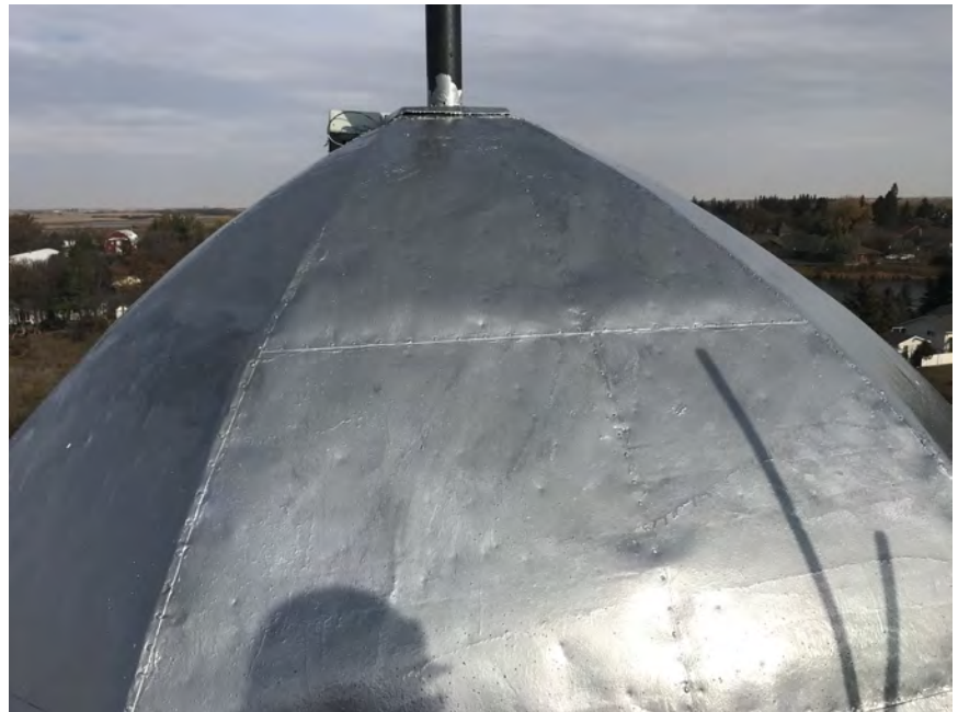
South Tower Metal Dome -After