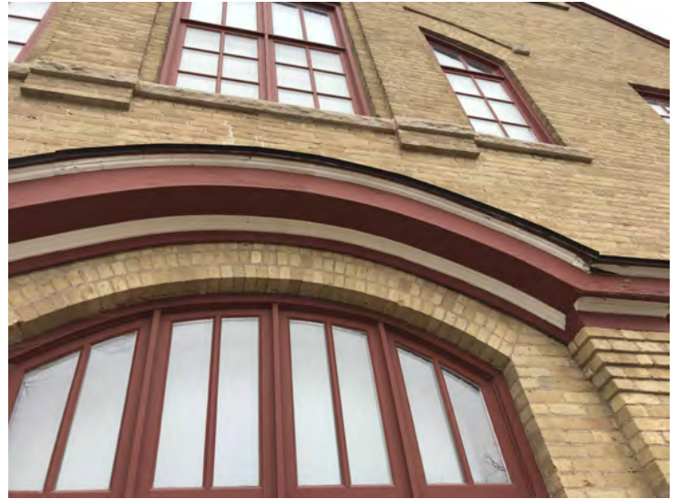
South Entrance Overhang -After