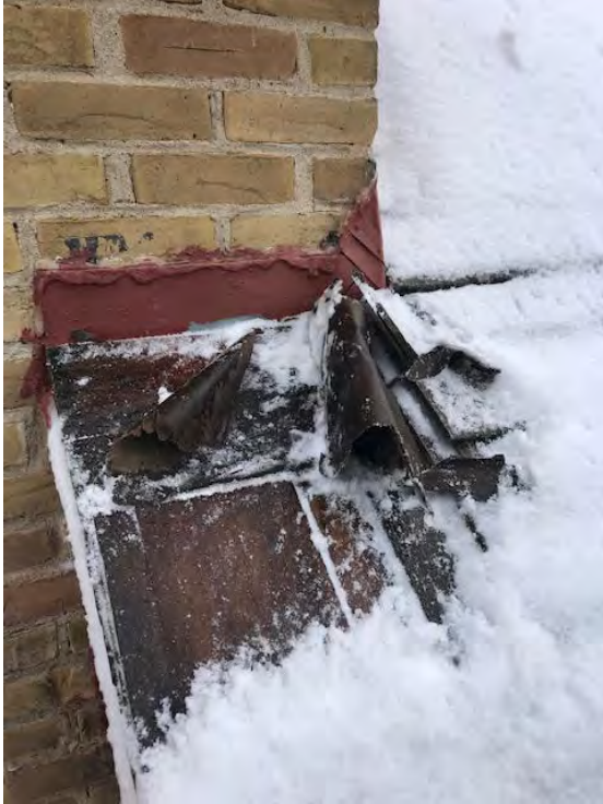
Additional Shingle Work - Before