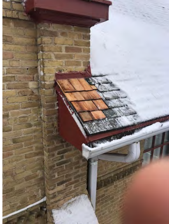
Additional Shingle Work - After