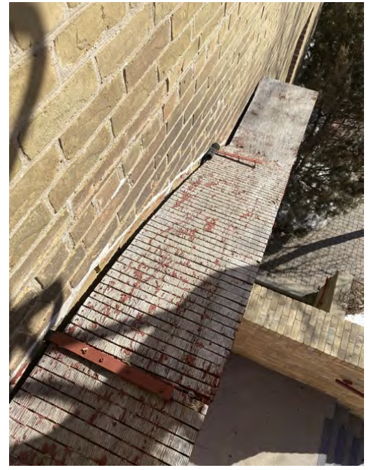
South Entrance Overhang -Before