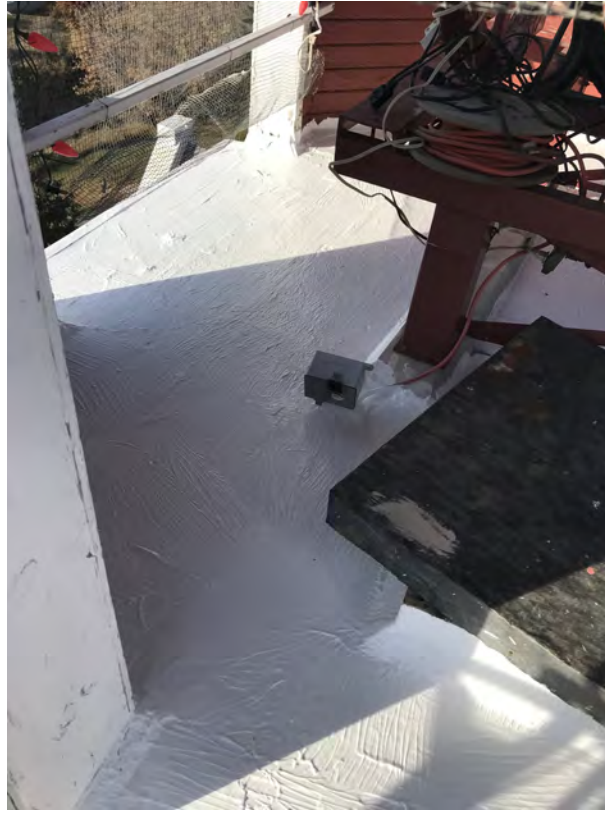
Bell Tower Roof - After