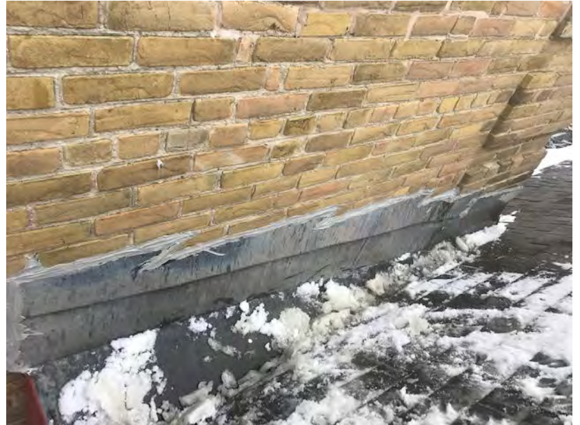
Roof-to wall valley - After